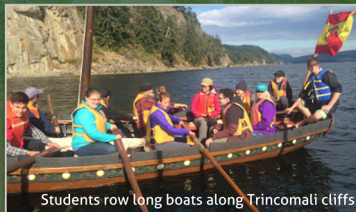
Students row long boats along Trincomali cliffs

This year we raised $13,000 which will be used to improve and enhance our environmental education program and offer bursaries to under-served youth. 74 walkers joined in on the fun. Our top fundraisers raised over $1,000 each - way to go! There were 9 musicians throughout the trail system. Celebration performers included T. Nile and Philip Buller. A big thanks to everyone who came out, donated, or played music to make this a very special day.