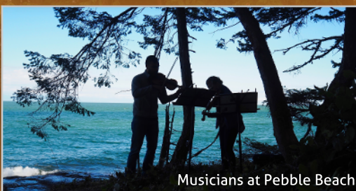
Musicians at Pebble Beach

The first summer of the Food Forest is drawing to a close. With the help of dedicated volunteers, and fantastic summer students we have got the social enterprise aspect of the Food Forest off the ground, selling greens, herbs and flowers on a weekly basis. We have had a consistent presence at the Saturday market and have enjoyed a regular demand for our early Food Forest offerings from local restaurants pilgrimme, Crane and Robin, Babes in the Woods and Martine's Catering. We began selling native plants at Galiano Trading which has worked well so far and will continue into the fall.