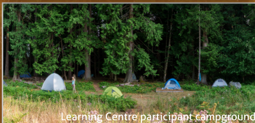
Learning Centre participant campground