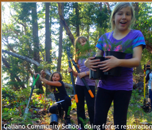
Galiano Community School doing forest restoration