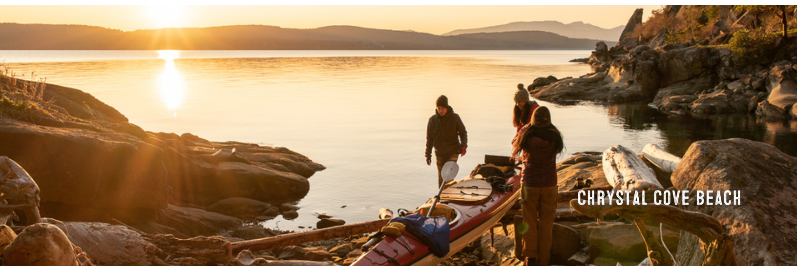
CHRYSTAL COVE BEACH

Don't have camping gear? We rent tents, sleeping bags, sleeping mats and headlamps. We have enough gear to sleep 36 individuals comfortably with 2-3 people to a tent.