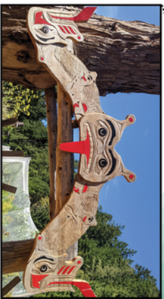
Food Forest, Plant Nursery, And Compost Hotspot