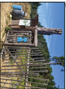
Nuts'a'maat Forage Forest