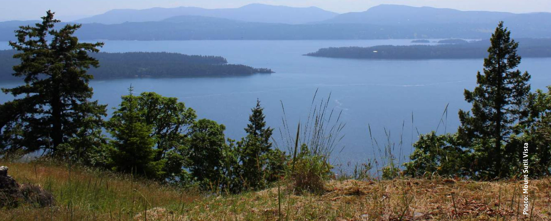
Photo: Mount Sutil Vista

Sharing these values with the community and engaging the next generation in respectful stewardship and sustainable living is paramount to extending our work's impact.