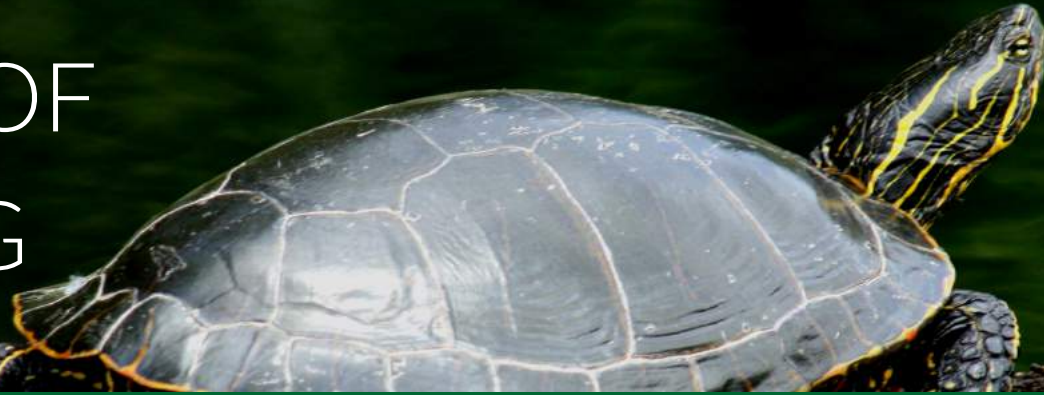
Photo: Western Painted Turtle