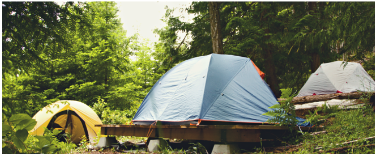
BACKCOUNTRY CAMPGROUND RAISED TENT PLATFORMS

This "glamp"-site is right next to our Classroom building, where you have access to a full kitchen, showers, flush toilets and wifi. The Classroom has an open dining hall that can also be slept in if you don't want to sleep outside. Campground capacity: 50 campers or 20 tents.