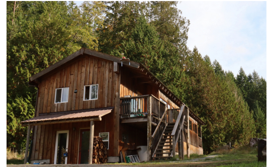
CLASSROOM AT FRONTCOUNTRY CAMPGROUND