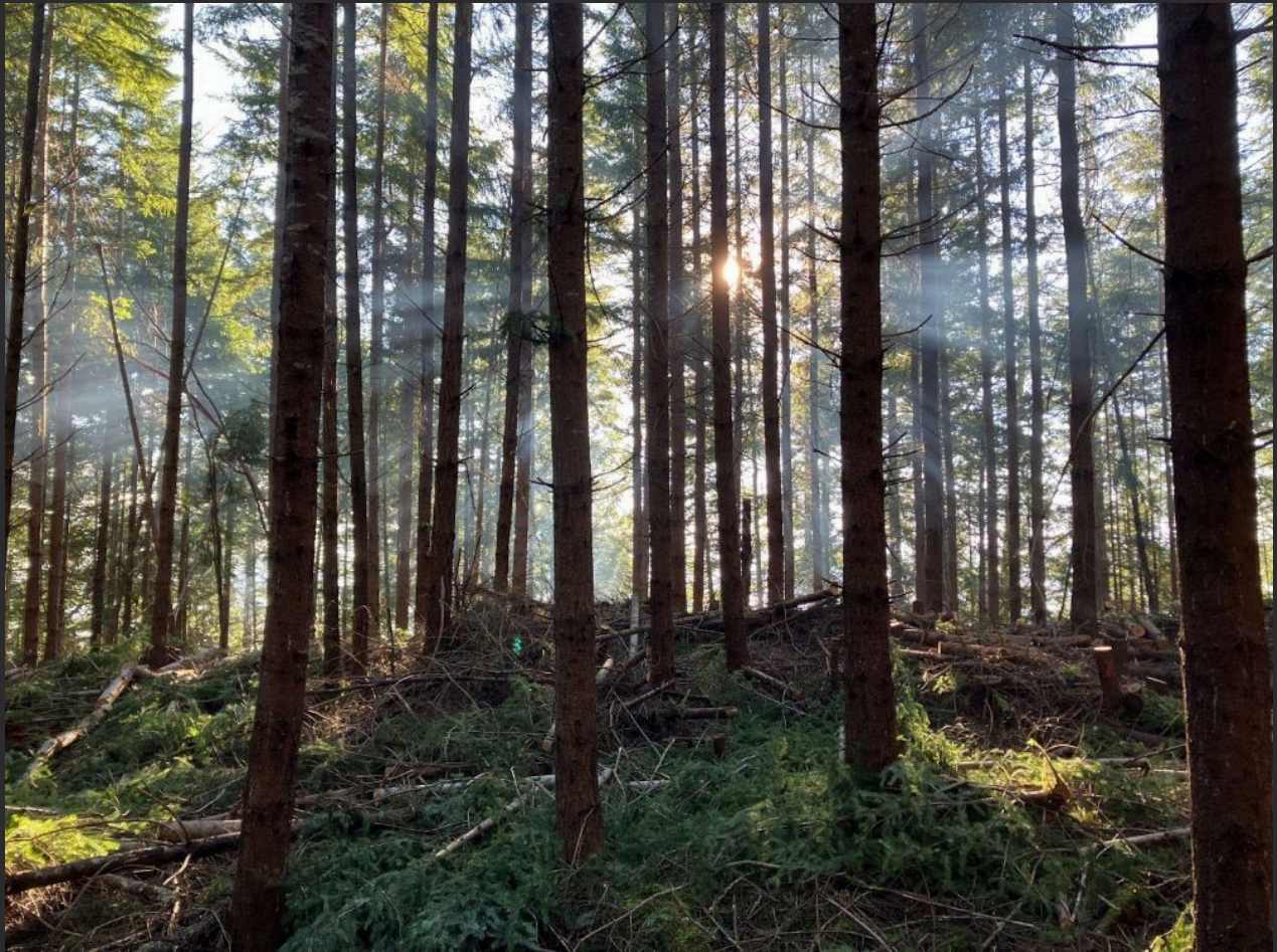
Image: Forest stand at Quadra Hill, post-thinning treatment

SAVE THE DATE- NEW EVENT WILL BE JUNE 7-8