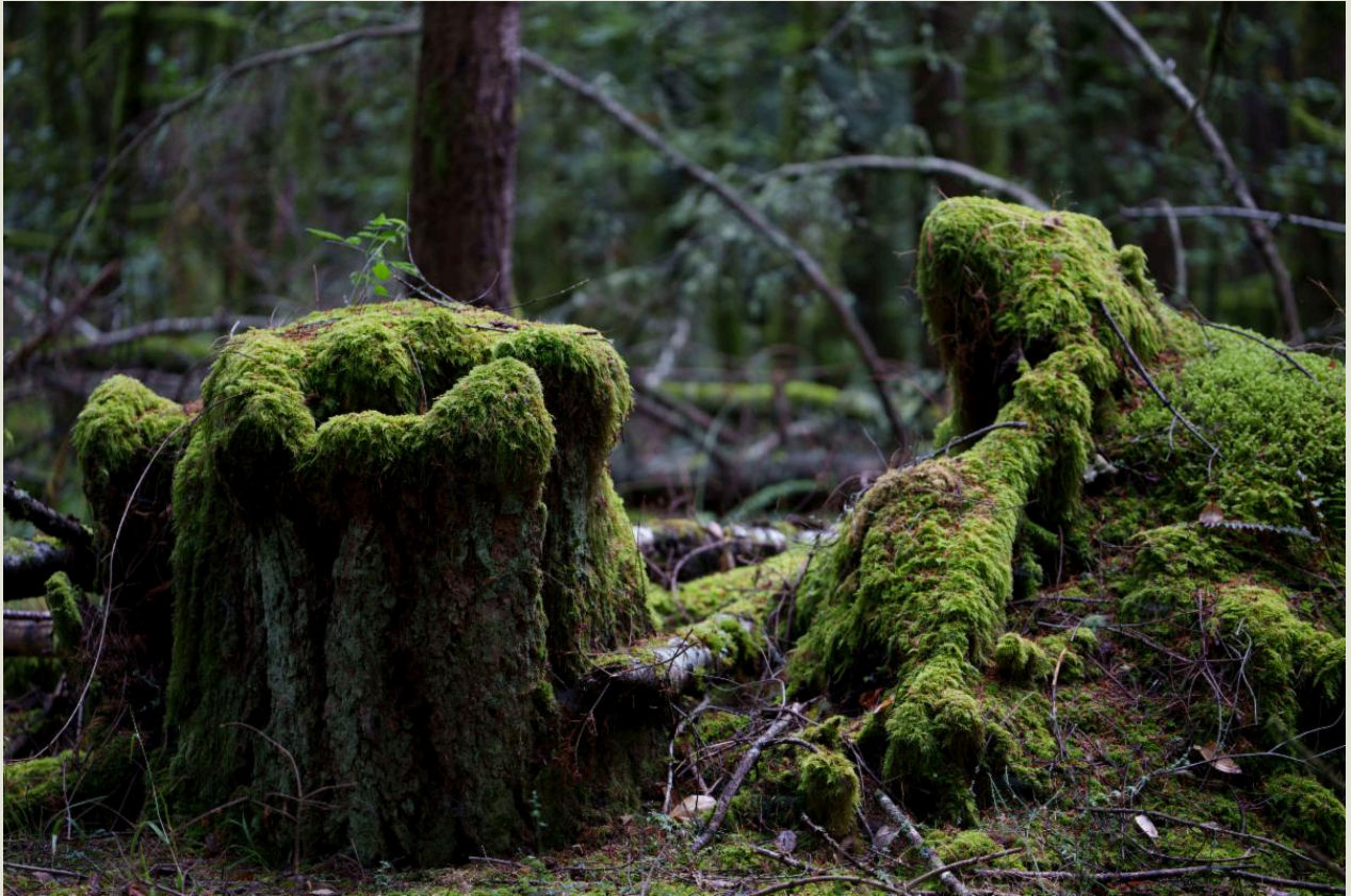
Image: Mossy stump at Laughlin Lake

Joining the Galiano Conservancy Association isn't just a formality—it's a commitment to protecting the wild, diverse beauty of Galiano Island and the Salish Sea. As a member, you're part of a growing community that supports land protection, ecological stewardship, sustainable living and agricultural practices, and hands-on environmental learning for all ages.