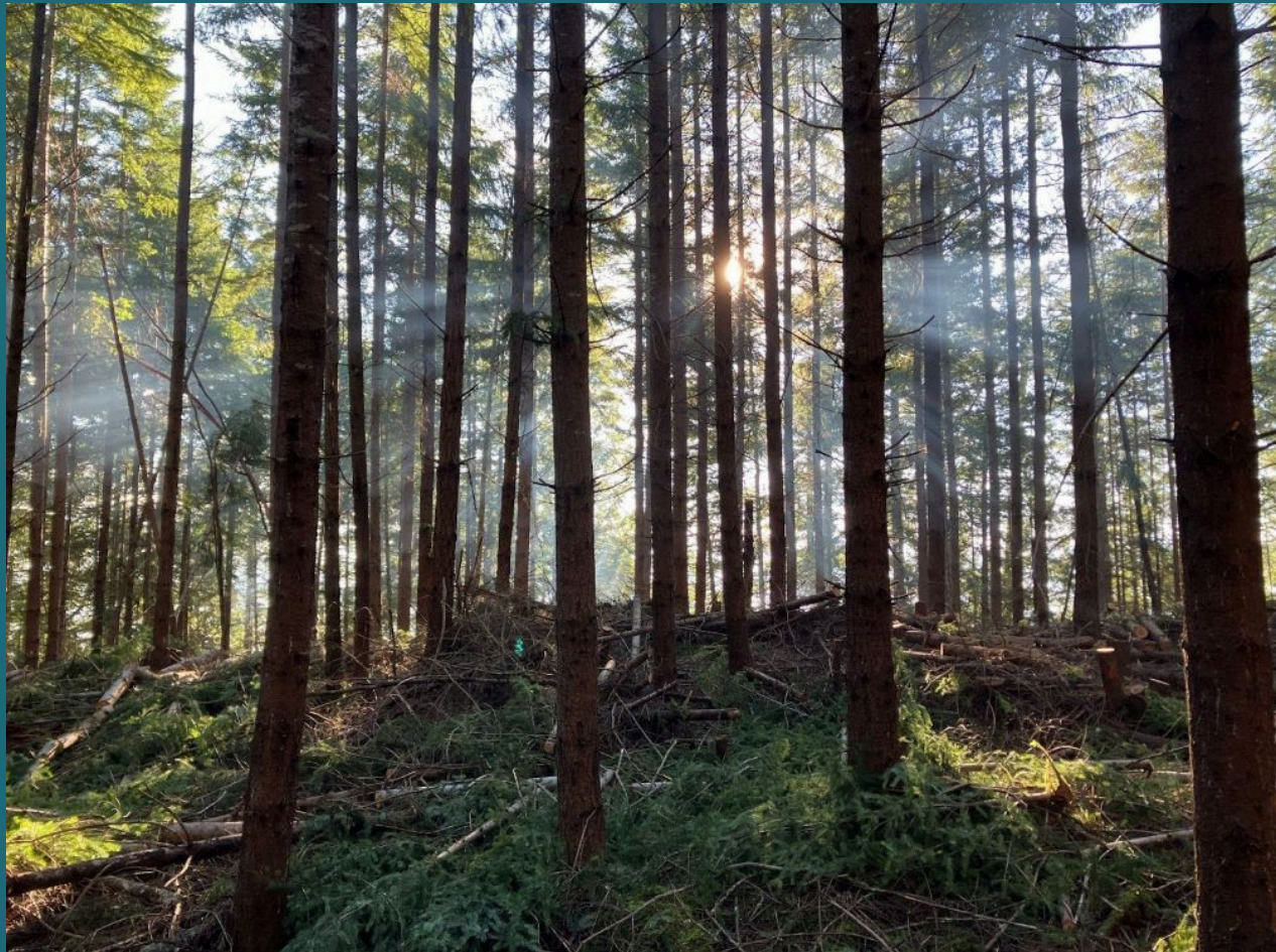
Image: Forest stand at Quadra Hill, post-thinning

Please join us for a free, family-friendly event to learn about how our forests can be made more healthy and resilient to wildfire and climate change. The GCA and partners are excited to showcase the results of the forest restoration work completed at the recently established Quadra Hill Nature Reserve.