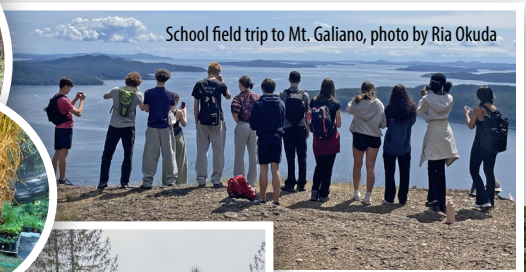
School field trip to Mt. Galiano