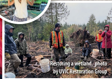
Restoring a wetland, photo by UVIC Restoration Group