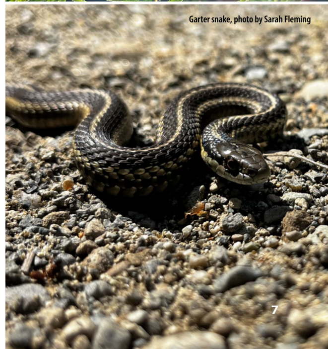
Garter snake