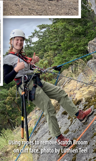
Using ropes to remove Scotch Broom on cliff face, photo by Lúthien Teel