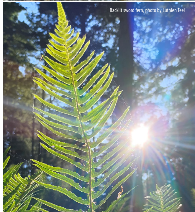
Backlit sword fern