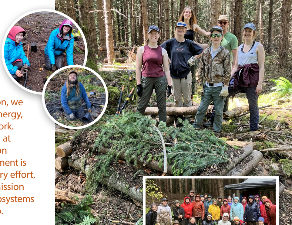
A few of our dedicated volunteers

supporting educational initiatives and sharing specialized skills. Each act (planting native species, maintaining trails, or lending support behind the scenes) plays an important role in stewarding the landscapes we all cherish.